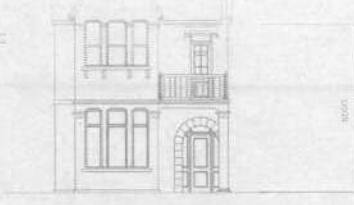
Front Elevation Scale 1:50