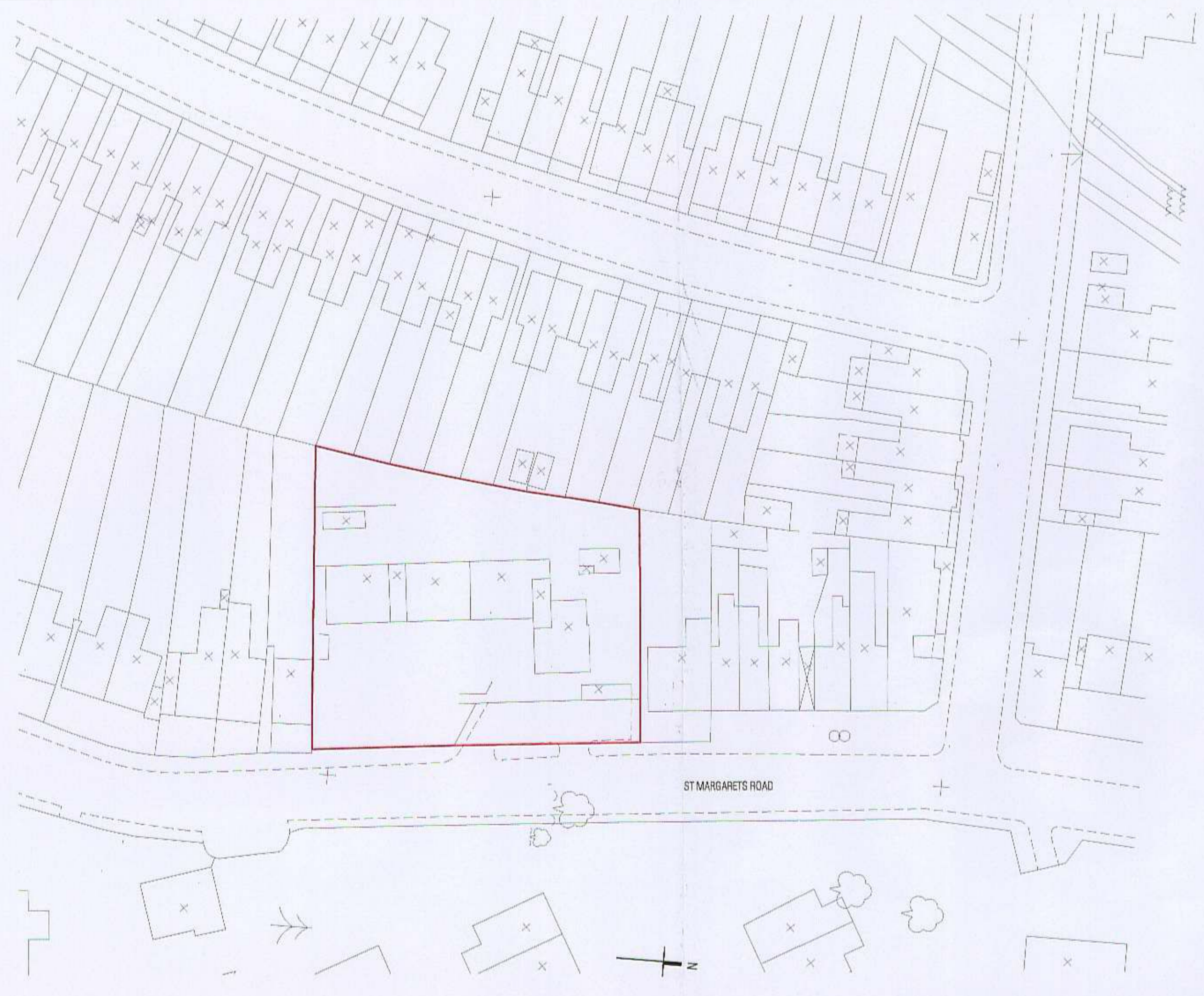
SITE LOCATION PLAN 1:500

RECEIVED 18 APR 2008 PLANNING 08/03071/FUL