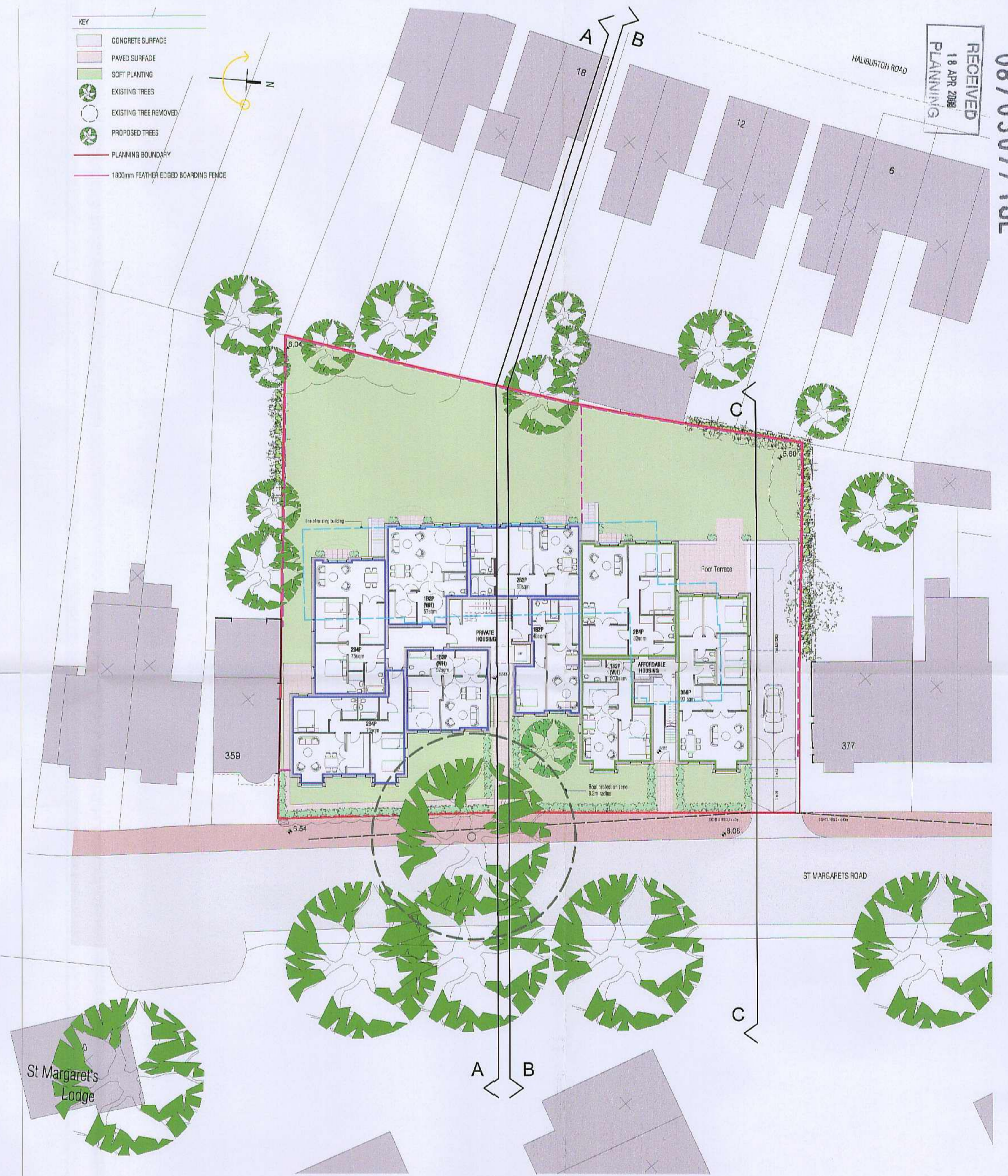
SITE LAYOUT 1:200