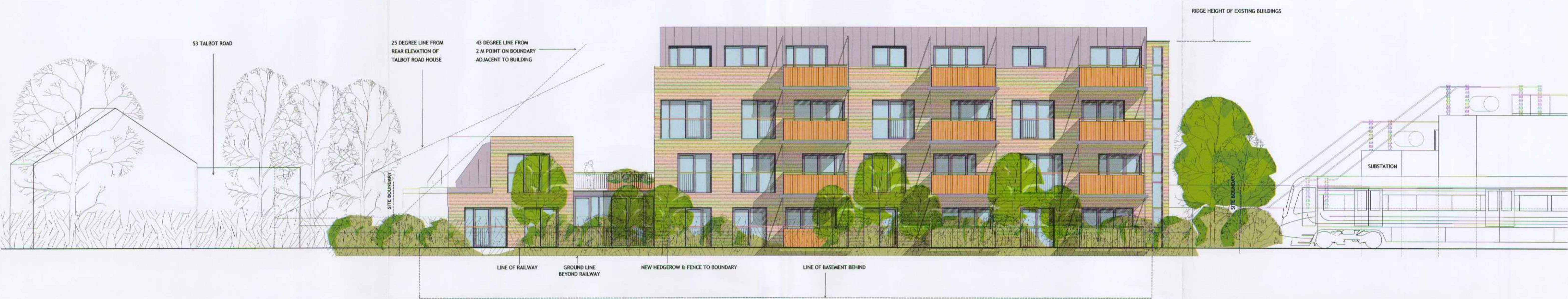
NORTH (RAILWAY) ELEVATION 1:100