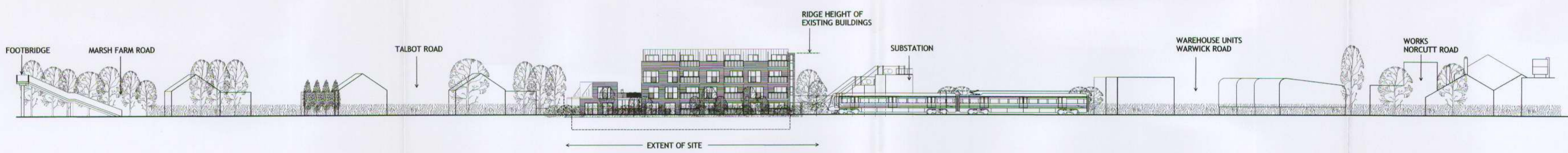
RAILWAY ELEVATION WITH CONTEXT 1:400