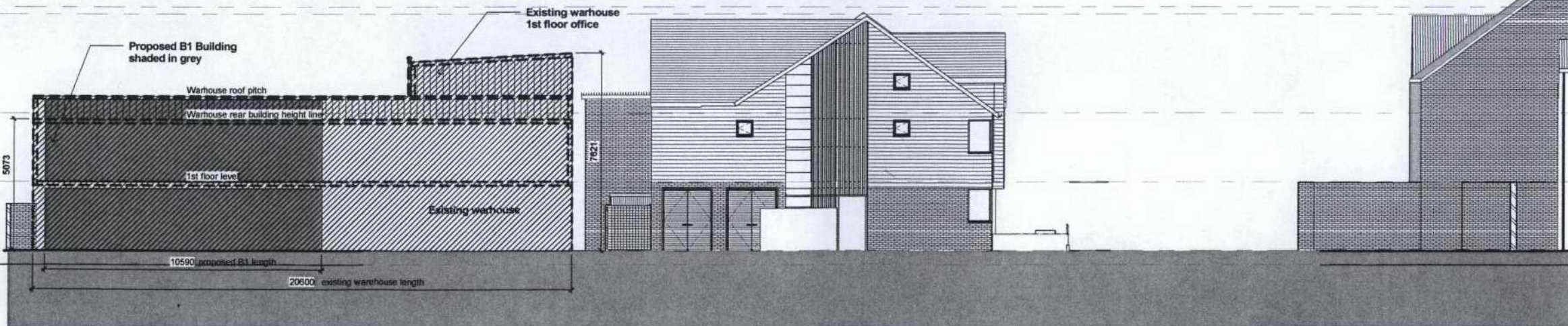
2 122 Existing & proposed west elevation 1 : 100

No. Notes 1. Dimensions to be verified on site. Only figured dimensions to be used and any discrepancies in dimensions are to be reported to the architect. No dimensions are to be scaled from printed drawings. Any areas indicated on this drawing are for guidance only. No responsibility is taken for their accuracy. 2. There is a risk of injury or death in construction if the works are not properly planned and supervised. The contractor must not undertake any element of the work without first having carried out the necessary risk assessments and prepared detailed method statements.