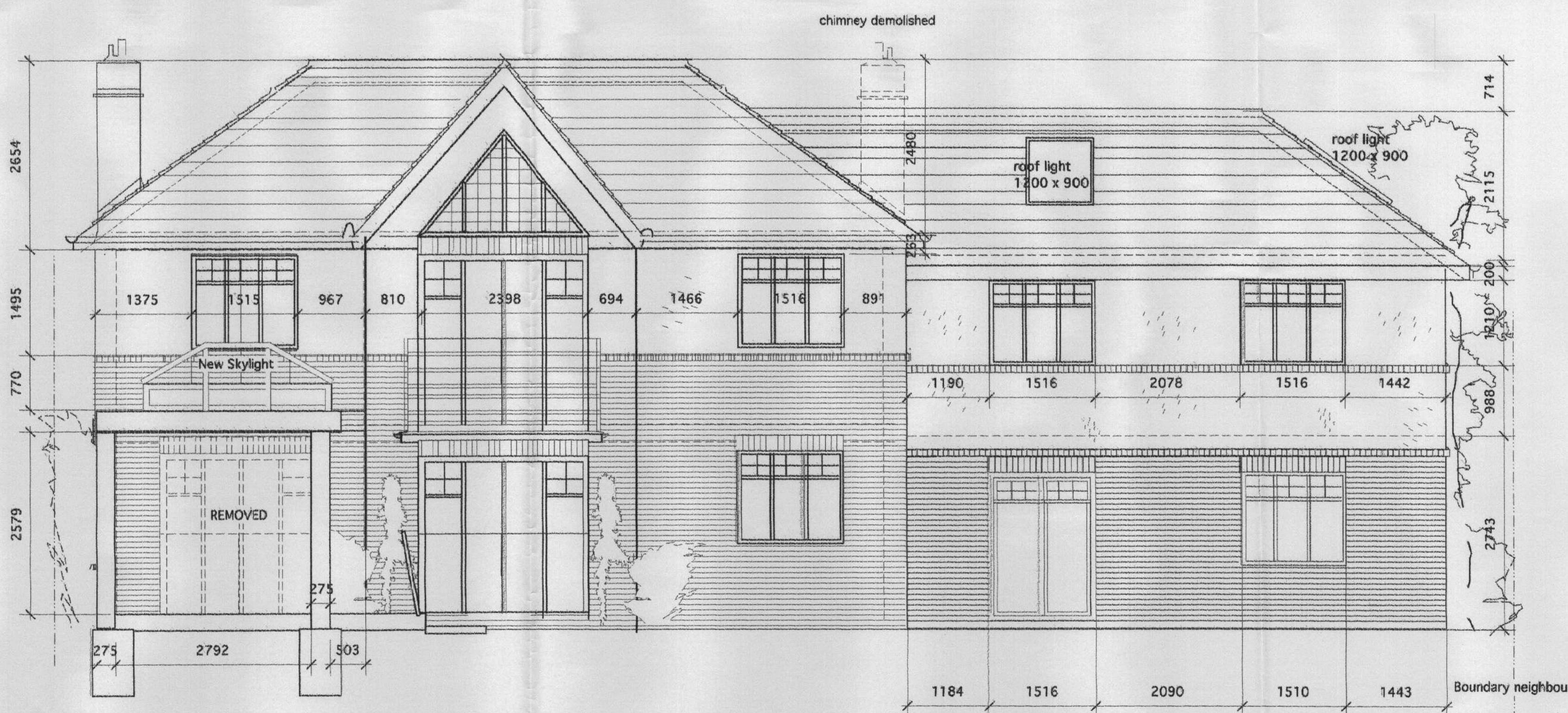
Rear Elevation 1:50

Rev A Pre-application planners & client comments added 11/4/02