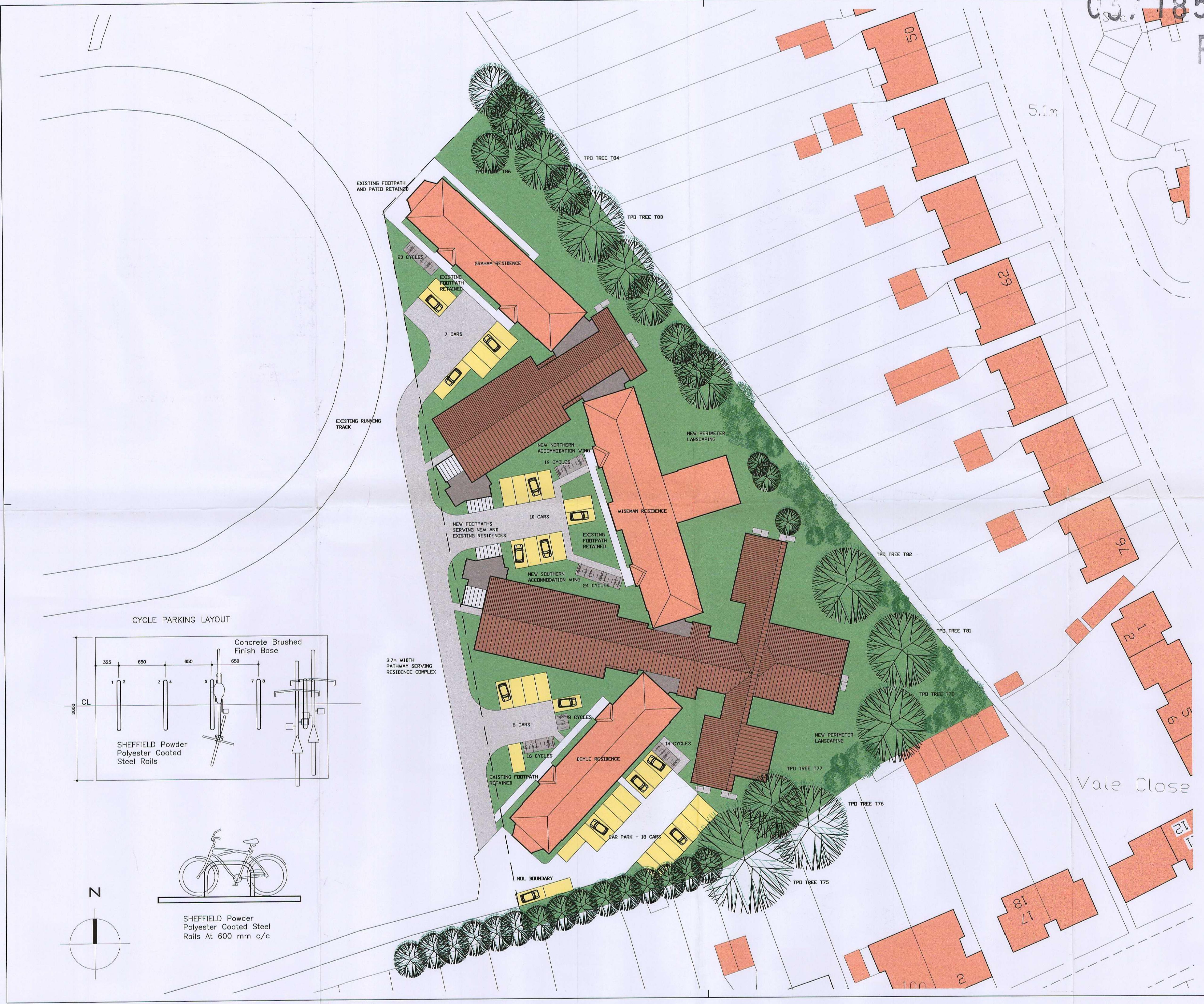
CYCLE PARKING LAYOUT