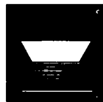
Type C - Wall Light