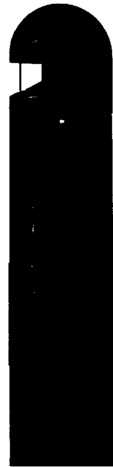
Type A - Bollard