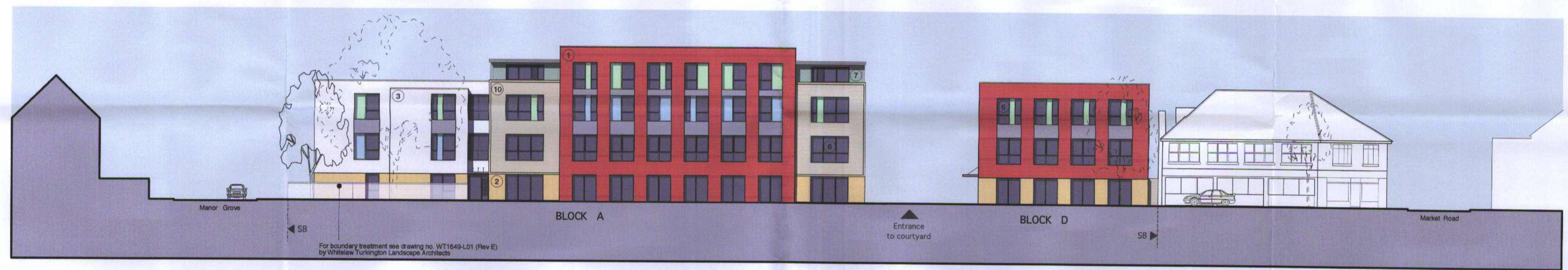
LOWER RICHMOND ROAD ELEVATION