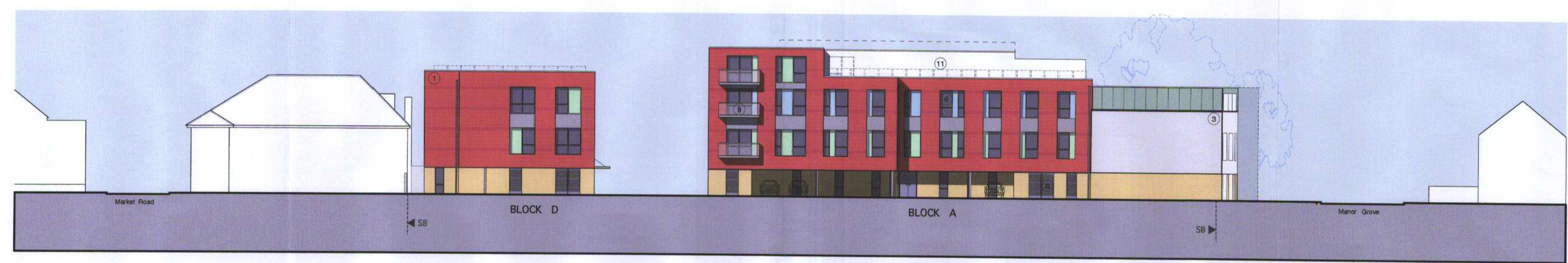
COURTYARD ELEVATION TO BLOCK A&D