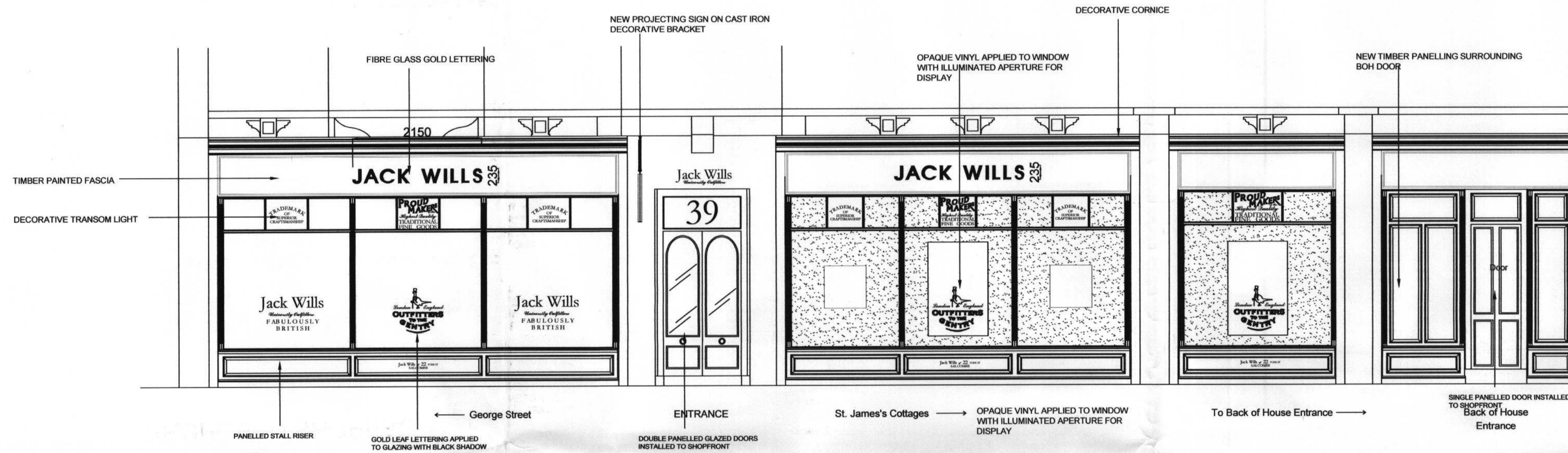
PROPOSED SHOPFRONT- FRONT ELEVATION