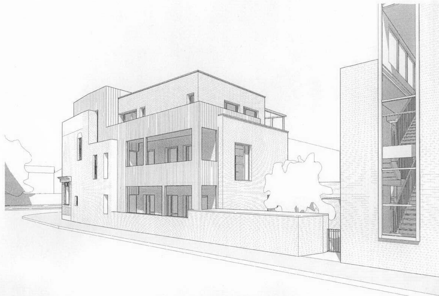
1 Indicative Massing - View One SK(00)005