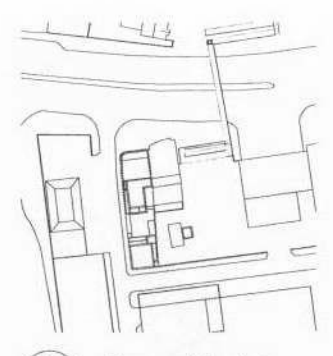
2 Proposed Context 1:1250