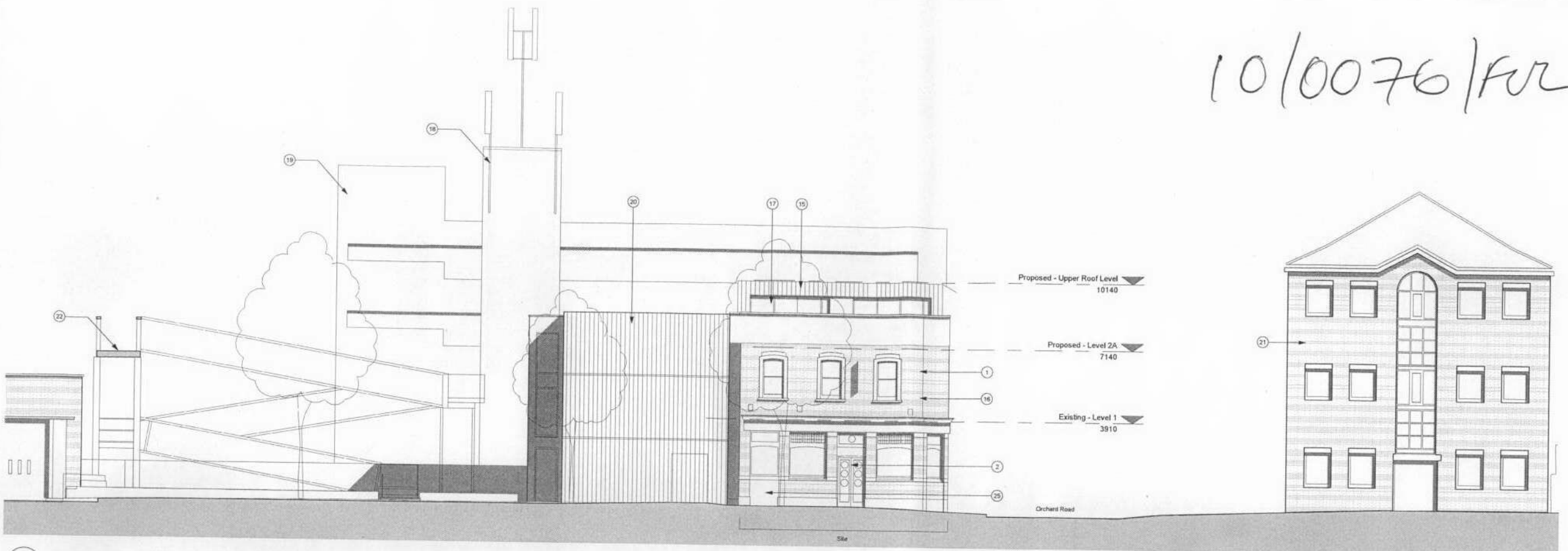
1 Proposed Elevation - Lower Richmond Road GA(00)100 1:100