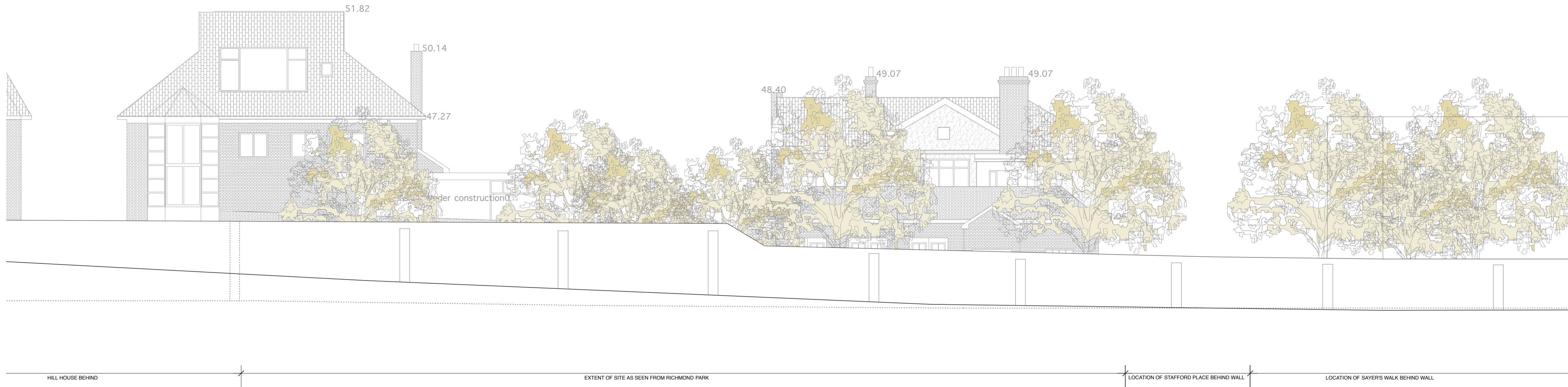
2 RICHMOND PARK ELEVATION (SOUTH FACING) 106 EXISTING SITE SCALE 1:100