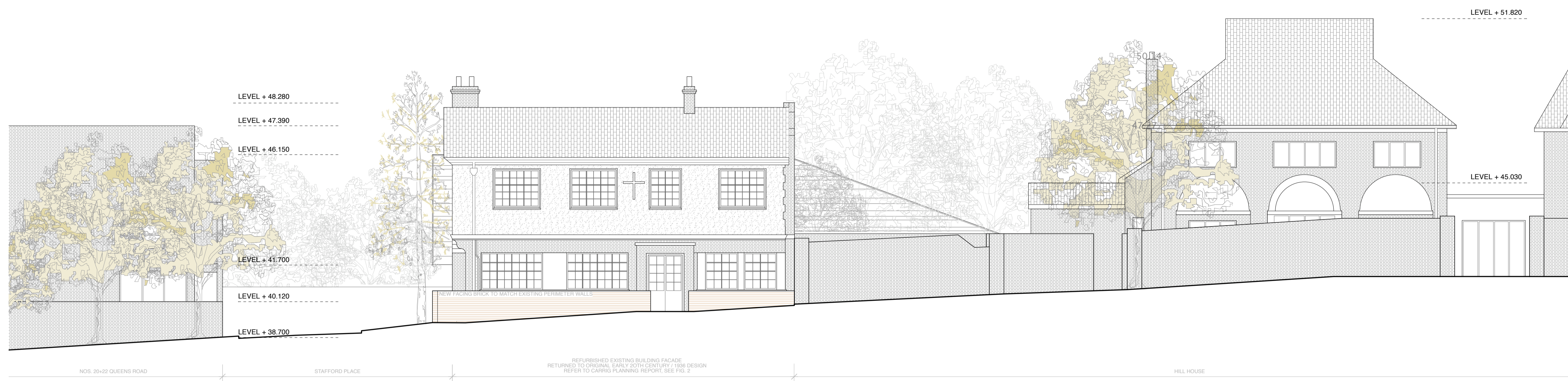
SECTION 1-1: ELEVATION TO QUEENS ROAD 204 PROPOSED SITE SCALE 1:100