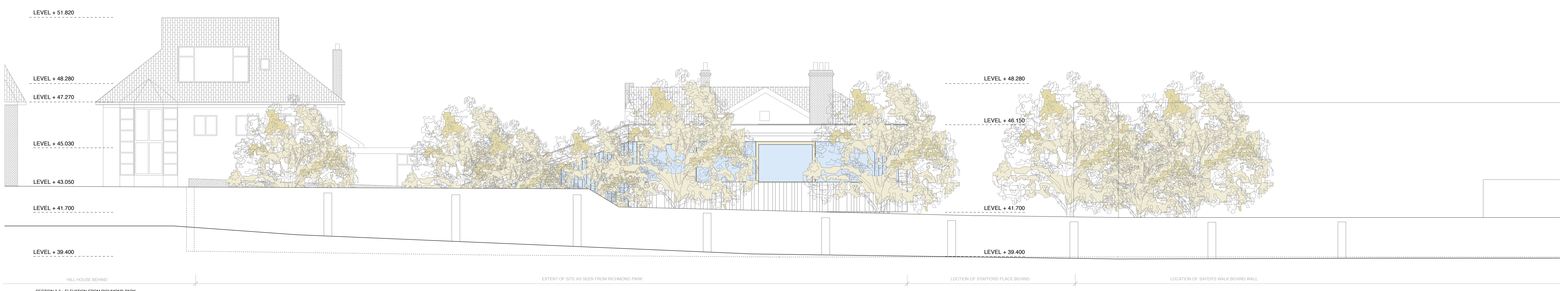
SECTION 3-3: ELEVATION FROM RICHMOND PARK 204 PROPOSED SITE SCALE 1:100