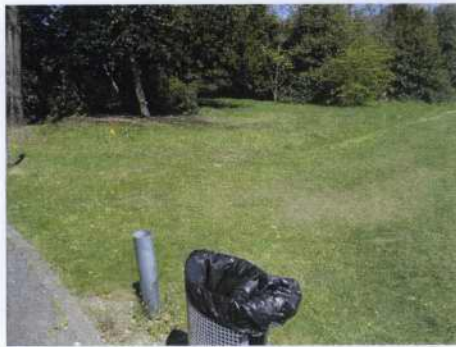
Proposed site with existing tree line in the background