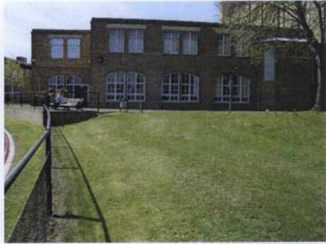
Proposed site with Library and Chapel Buildings in the background