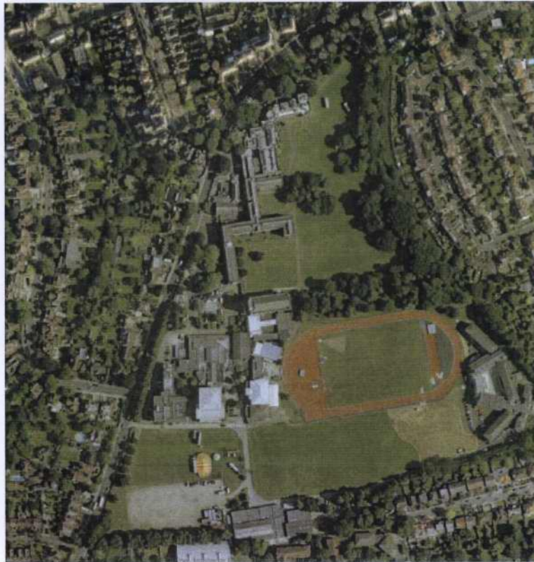
Aerial site photograph showing St. Mary's University College Strawberry Hill Campus

The existing external emergency escape routes around the existing buildings remain unaffected by the project. All fire procedures after evacuating the building will be as per St. Mary's University College standard procedures.