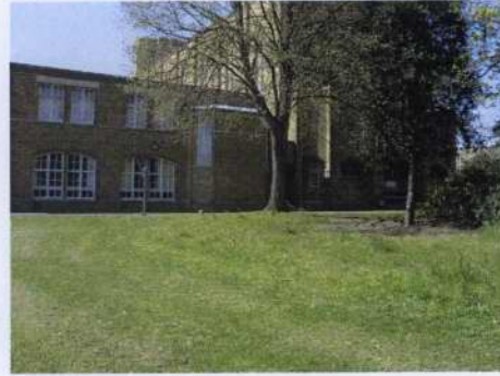
Proposed site with Library and Chapel Buildings in the background