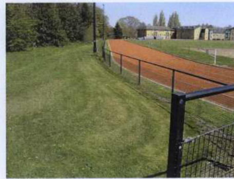
Proposed site with existing tree line and existing athletics track in the background