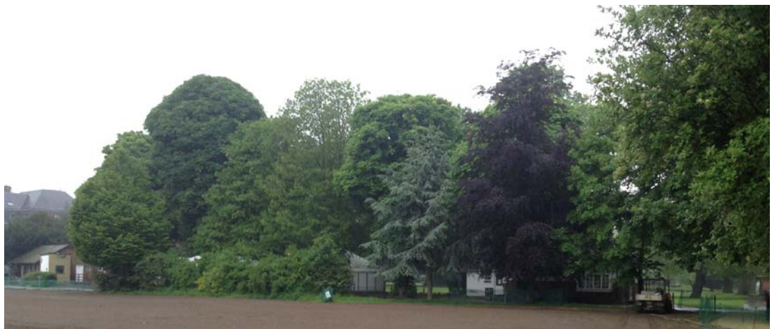
Tree screening to the site area as seen from the Thames path approach looking westwards

The trees also effectively screen the building and minimise the impact on distant views of the site from the River Thames. The irregular spacing of the tree boles and the variegated colour palette can provide visual cues to which the design may respond.