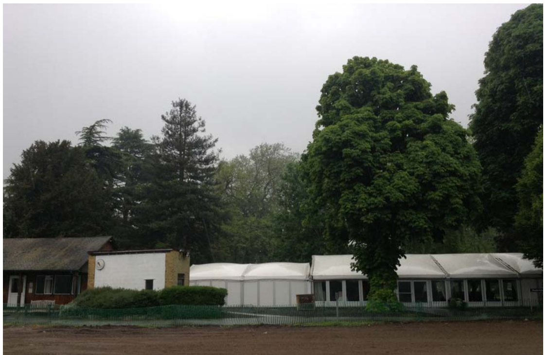
Existing buildings to be removed: top: the old wine bar, redundant cricket score board/planroom & golf pavilion beyond; below, marquee