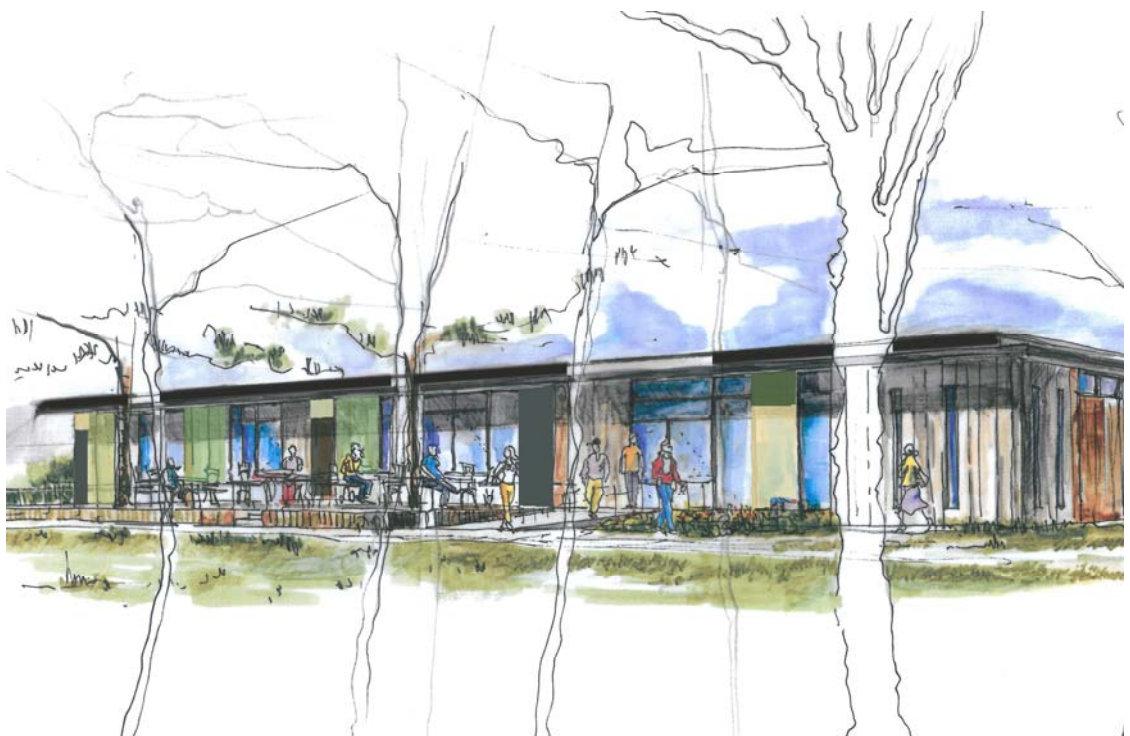
Concept sketch study

The single storey structure is of a similar scale to fit beneath the tree canopy and will have no appreciable effect on the site when viewed from the river.