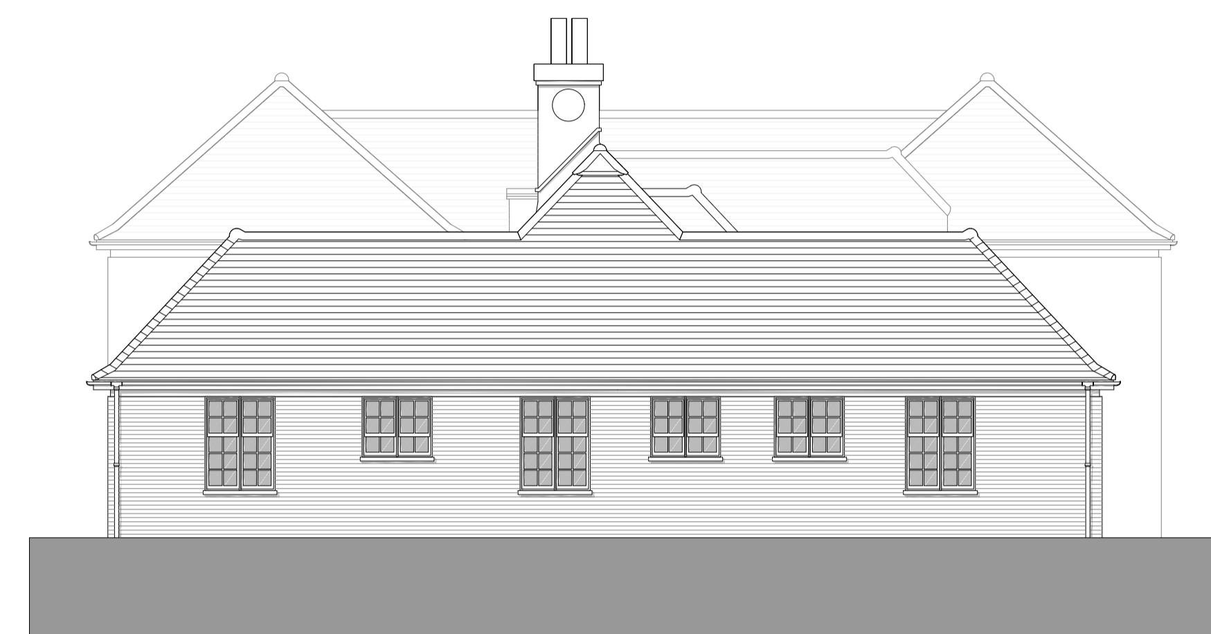
Proposed South (Side) Elevation Scale 1:100