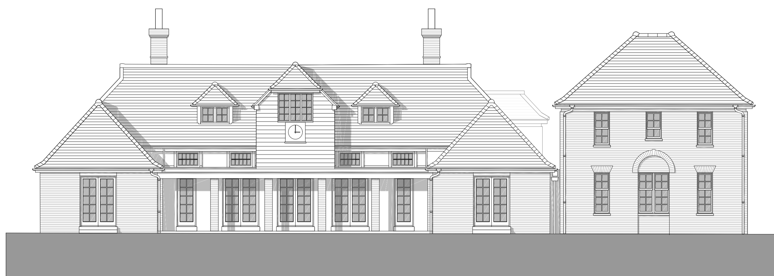
Proposed East (Rear) Elevation Scale 1:100