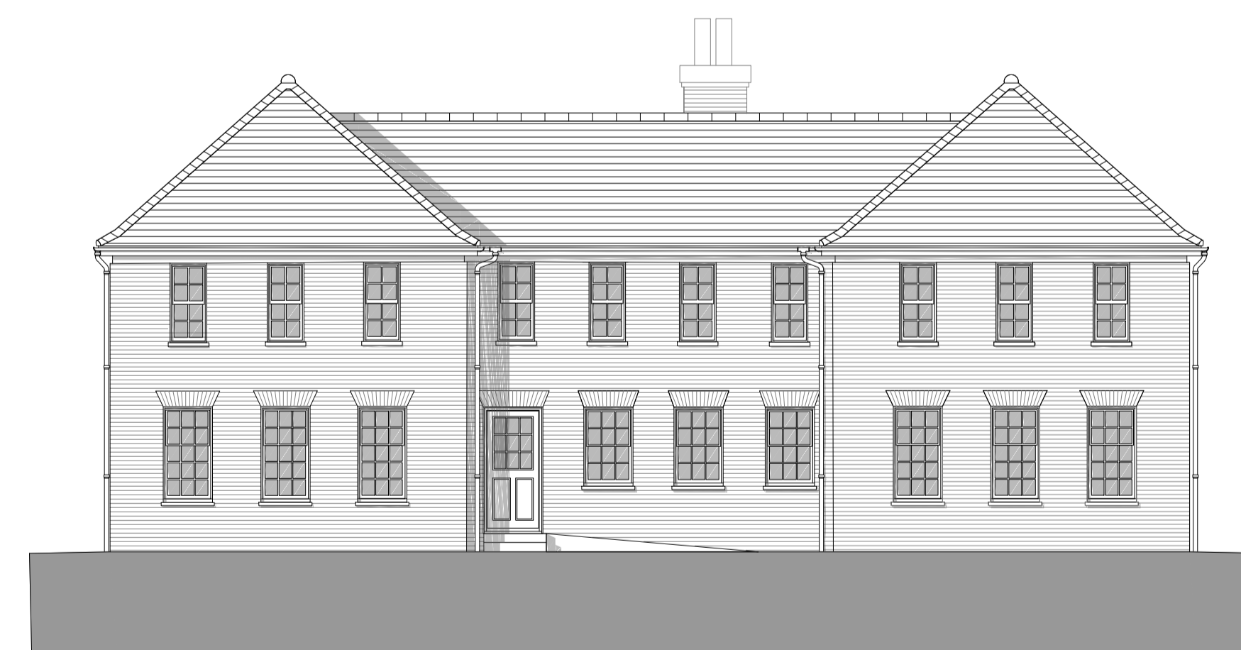
Proposed North (Side) Elevation Scale 1:100