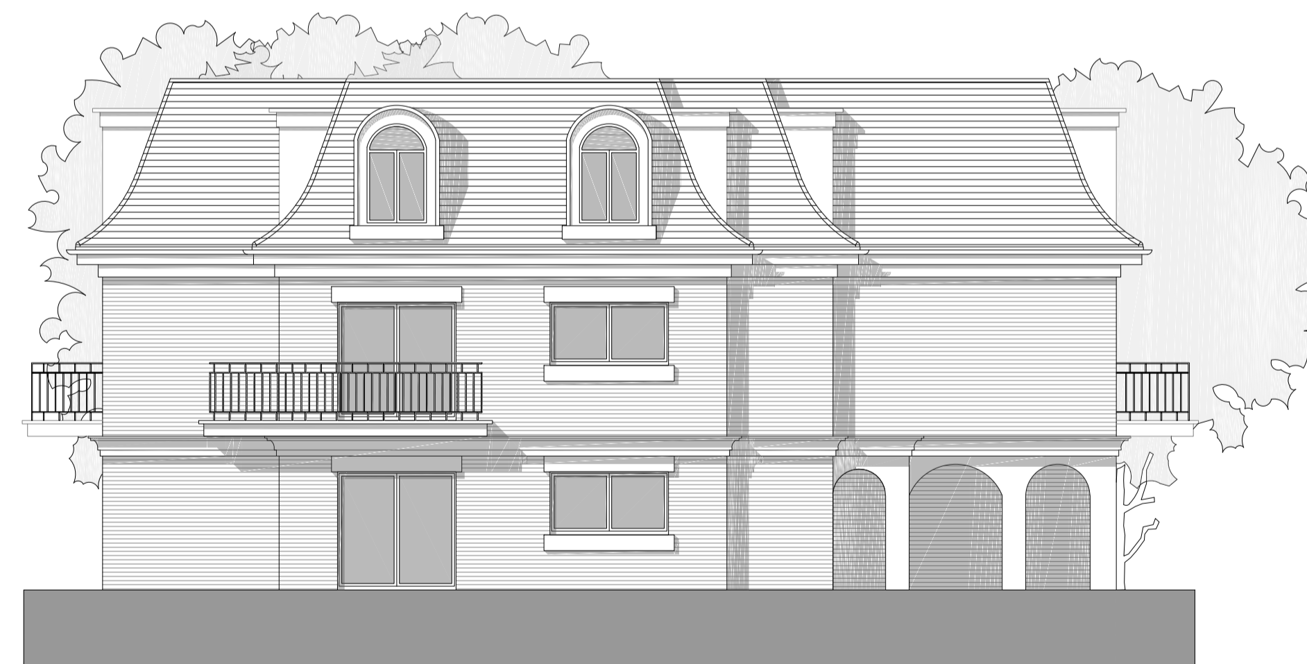
Proposed North (Side) Elevation Scale 1:100