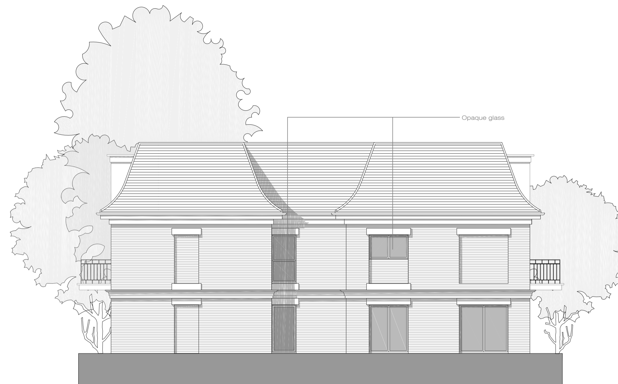
Proposed South (Side) Elevation Scale 1:100