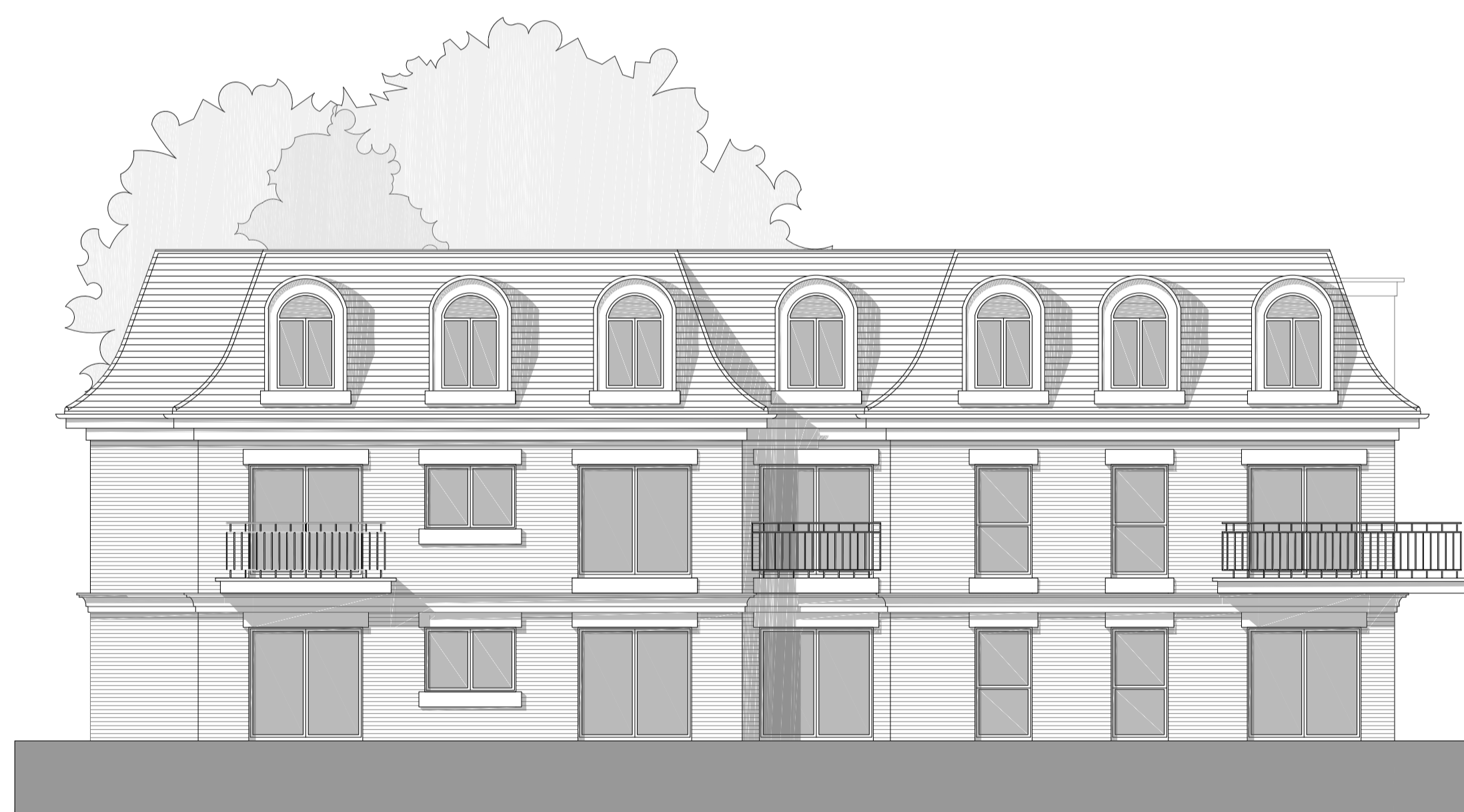
Proposed East (Rear) Elevation Scale 1:100