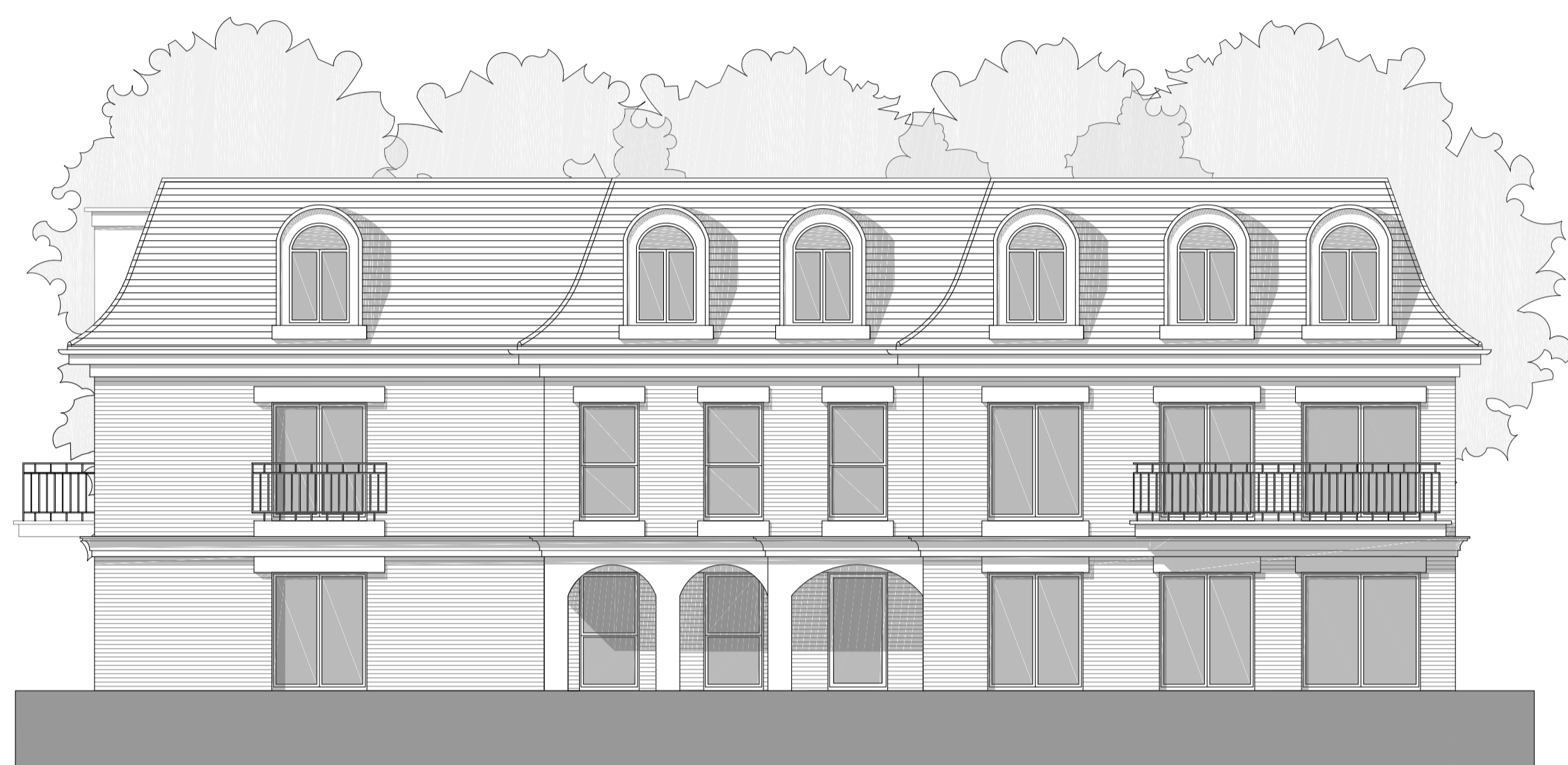
Proposed West (Front) Elevation Scale 1:100