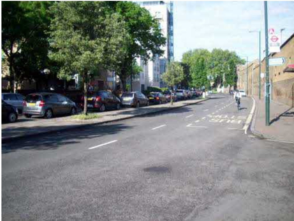
9. Mortlake High Street with queue approaching Mortlake roundabout