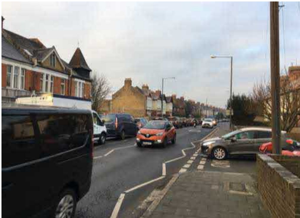
14. Same queue approaching Chalkers Corner – car having difficulty in joining queue from Watney Road