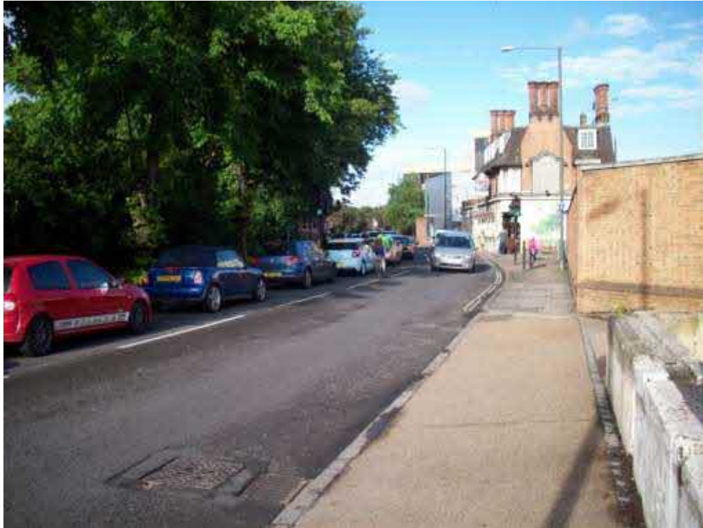
11. Same queue in Lower Richmond Road approaching Chalkers Corner past the Brewery