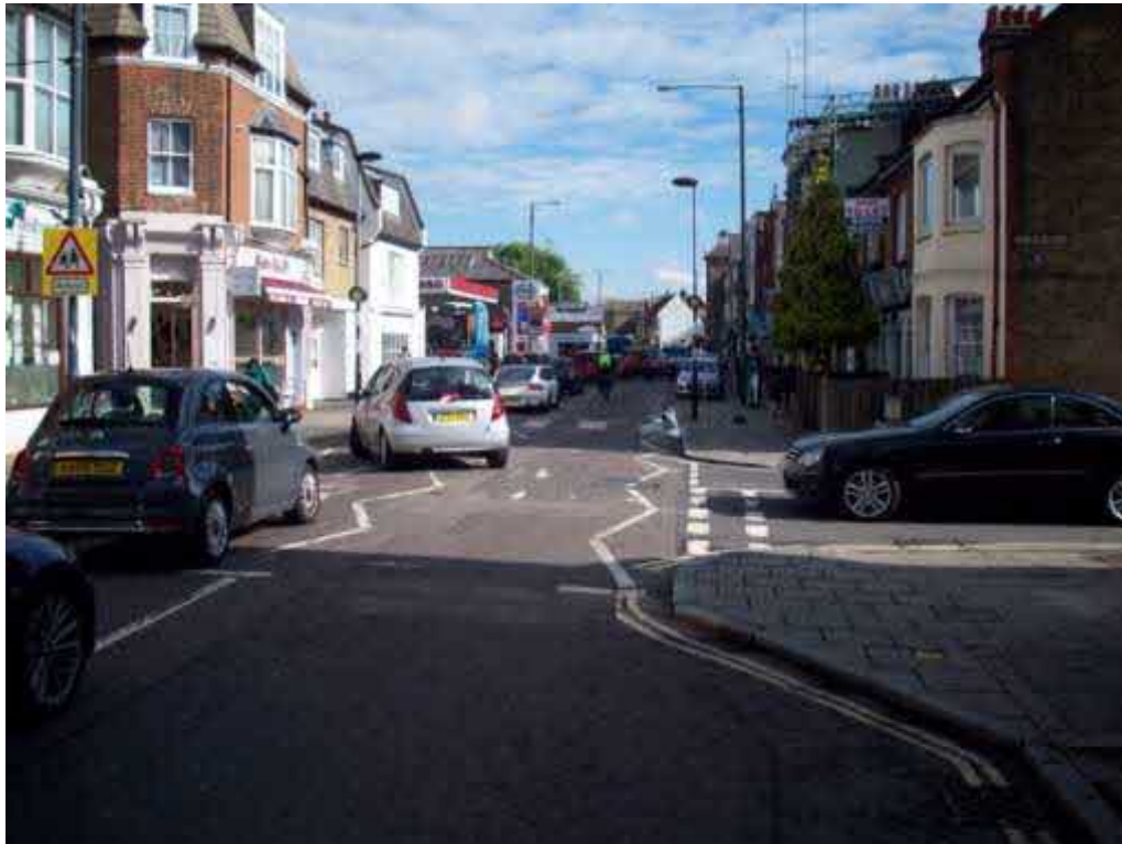
2. Same queue towards crossing – traffic in Vernon Road has difficulty in joining