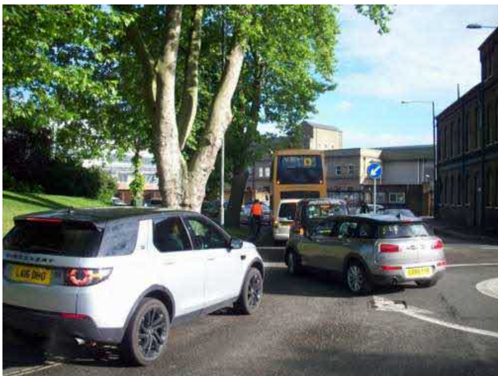
10. Mortlake roundabout with queue into Lower Richmond Road approaching Chalker's Corner