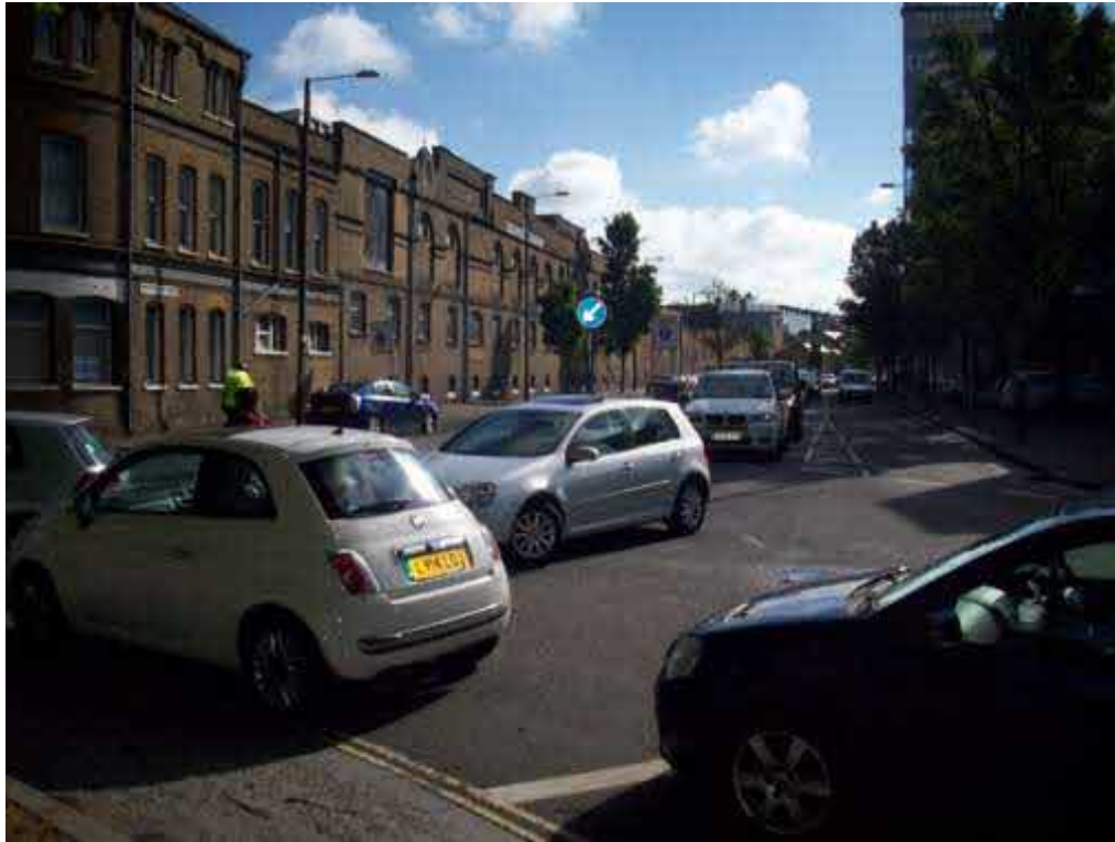
8. Mortlake roundabout with queue approaching from Mortlake High Street