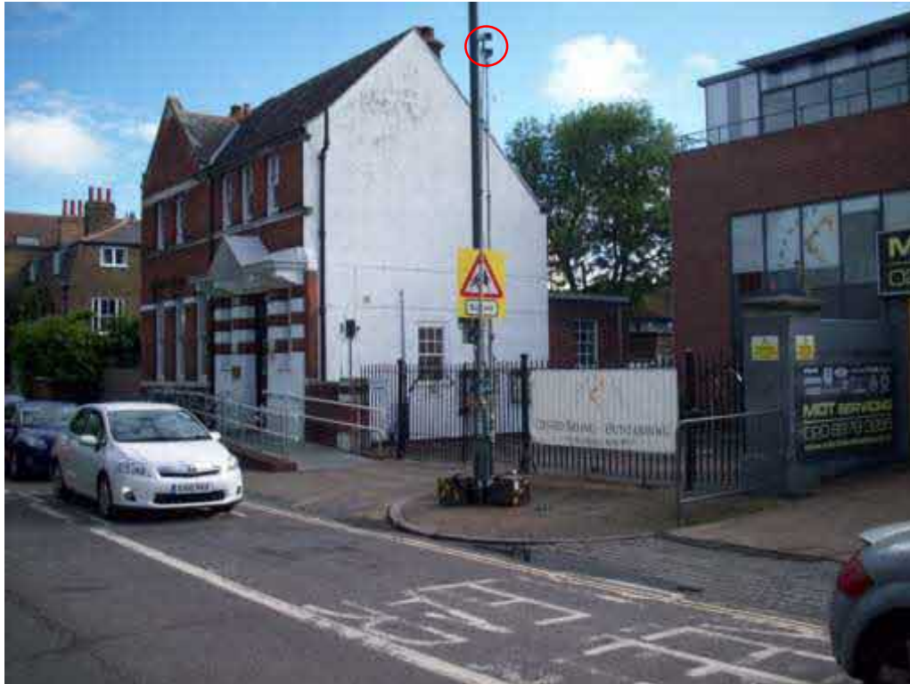
4. Thomson House School from level crossing – note cameras