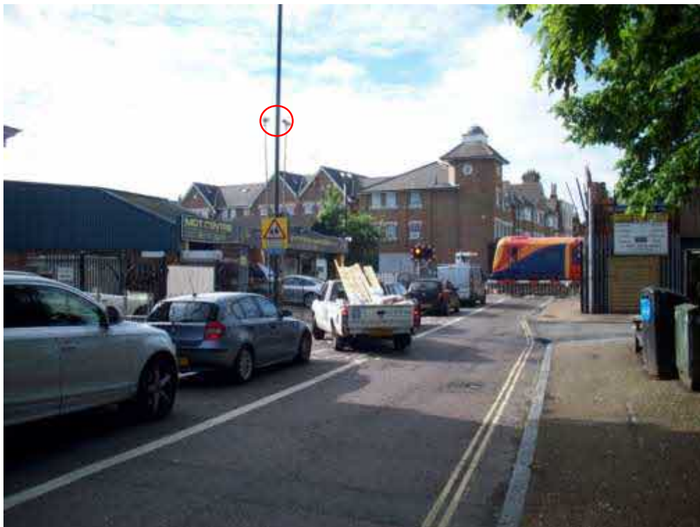
5. Queue approaching level crossing from Mortlake roundabout – note cameras