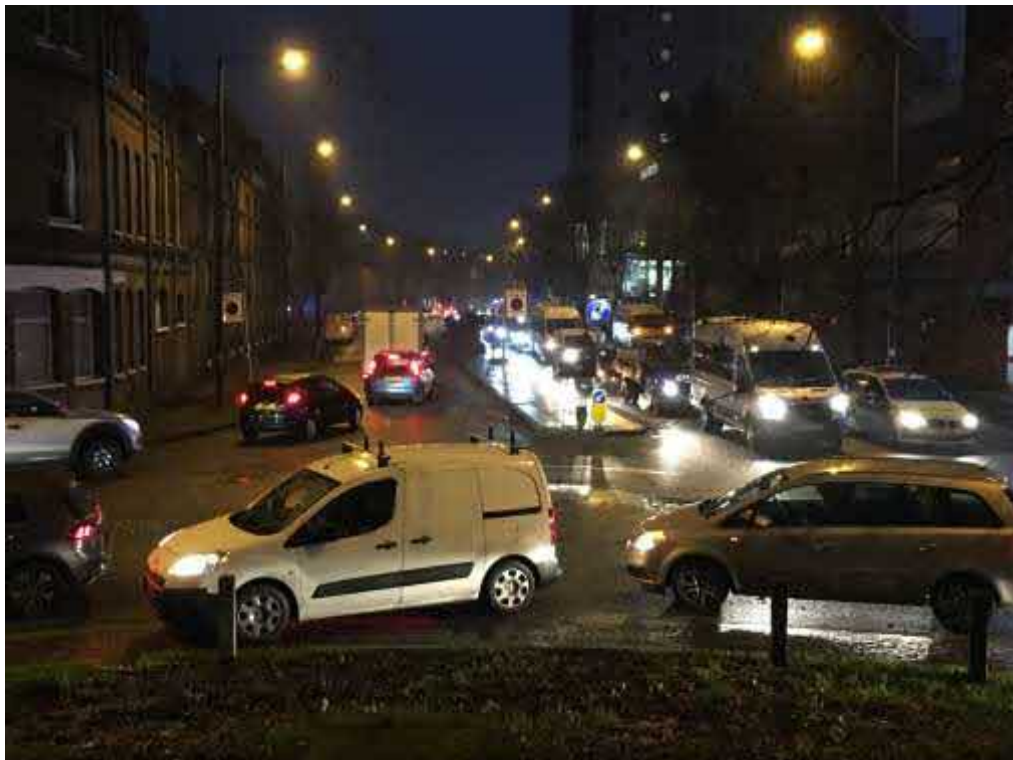
Same view in the evening