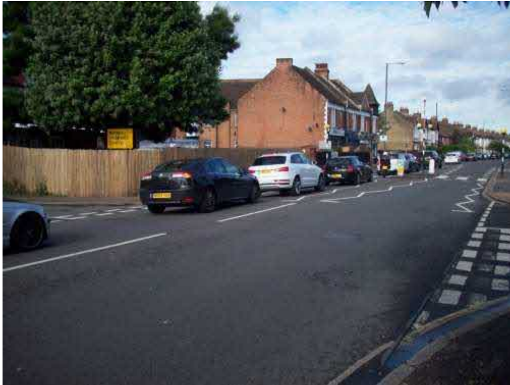
13. Same queue approaching Chalker's Corner past Children's Centre