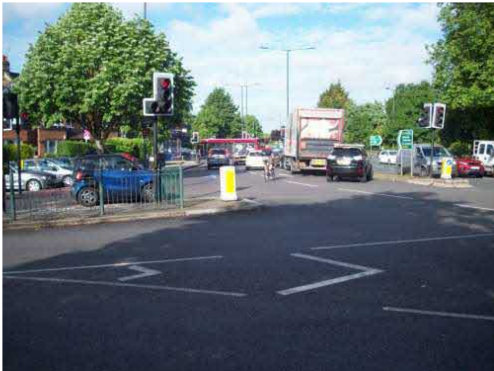
16. Chalker's Corner – note tight space for traffic turning right towards Kew