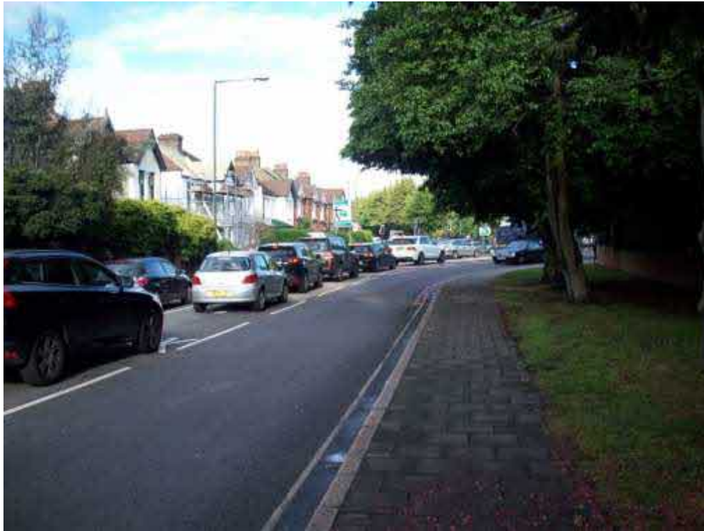
15. Same queue approaching Chalker's Corner past Chertsey Court