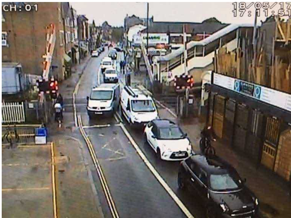
6. Sheen Lane crossing from the camera seen in the previous three photos