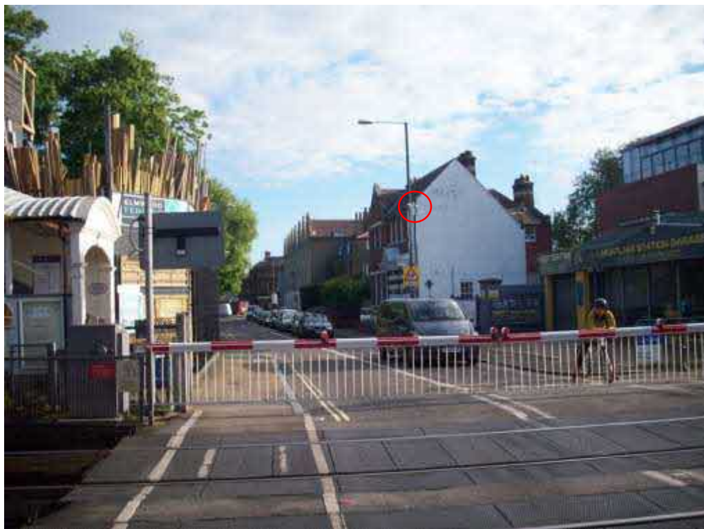
3. Level crossing with traffic queuing from Mortlake roundabout – note cameras