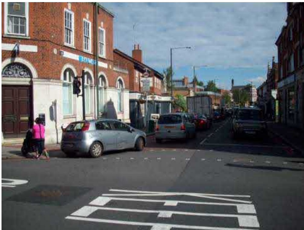
1. Queue off Upper Richmond Road into Sheen Lane approaching level crossing